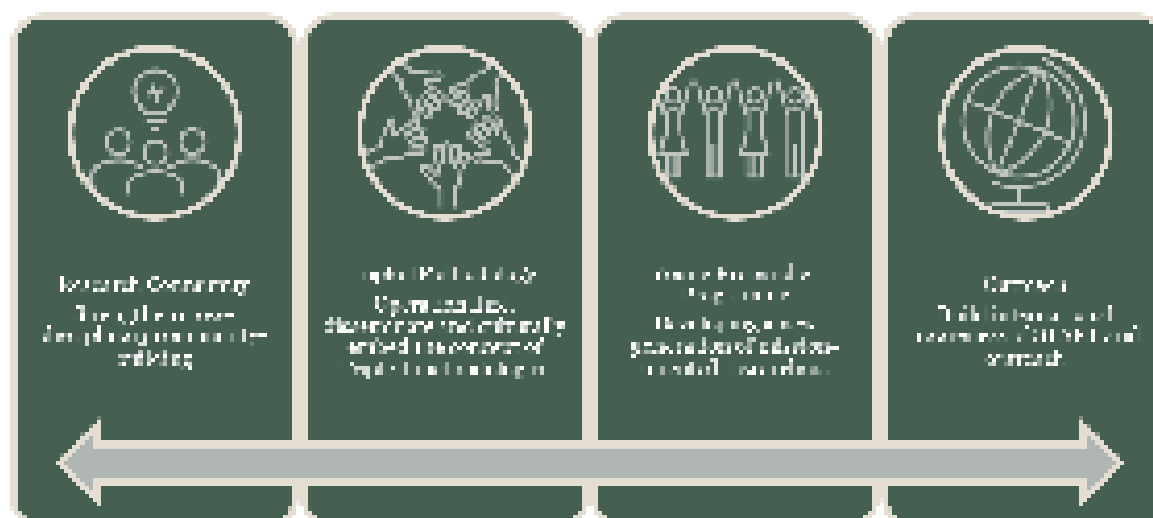
Figure 1: START - The four key objectives.

Figure 1 describes the key objectives of START, which align with the aspirational goals of the Code of Conduct, which are: