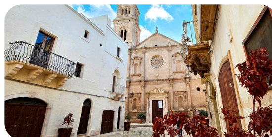
Chiesa Matrice di San Giovanni Battista in Fasano