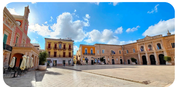
Historic centre of Fasano