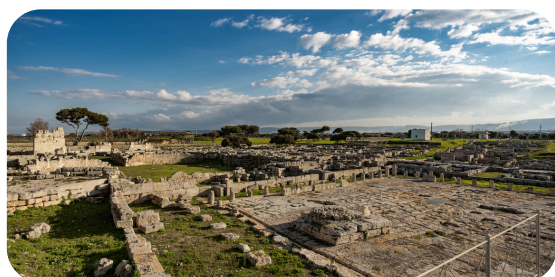
Egnazia National Museum and Archaeological Park